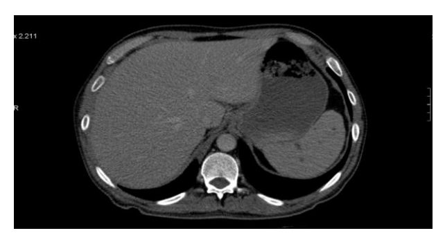
Figure-1a. Hypodense lesions in the spleen in abdominal CT.

On the 27<sup>th</sup> day, the patient became febrile again and lipamp-B was restarted. We suspected CDC because of abdominal pain, high ALP level and fever without any positive culture. Hypodense nodular lesions in the spleen which were compatible with CDC infection and were seen on the abdominal CT. All the antibiotics were stopped and caspofungin acetate (70 mg/day as a loading dose than 50 mg/day as maintenance) was added to the treatment of the patient.