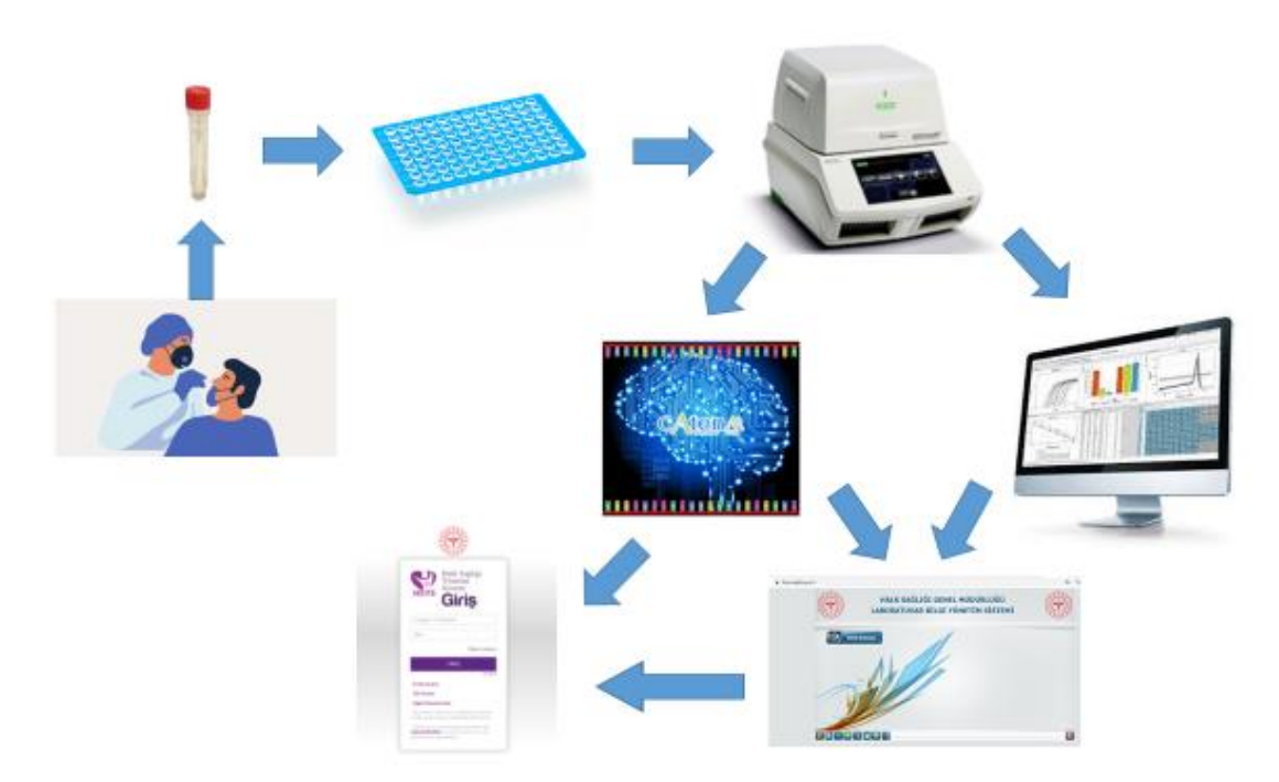
Figure 1. The process of collecting data, analyzing it, and submitting the results. The specialist should manually submit the results to the Laboratory Information Management System upon completion of the analysis on the PCR instrument. On the other hand, the approved results are automatically transacted to the Laboratory Information Management System via the CAtenA.

its suggestions. After expert approval, the PCR results are transected to the LBYS, HSYS, and e-pulse (URL_3).