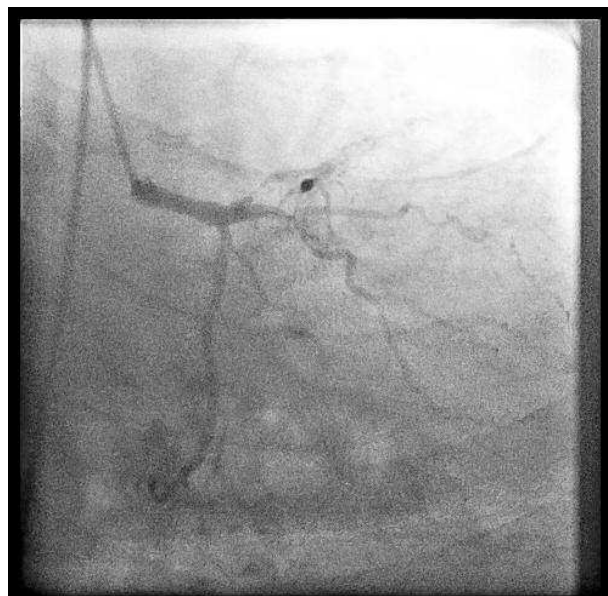
Figure 1. The mid segment of the left anterior descending artery (LAD) was critically stenotic up to 90%.

Surgery was scheduled and off-pump procedure was performed to prevent excessive bleeding and avoid cardiopulmonary bypass induced coagulation disorders. In the morning one hour prior to surgery 3000U of high purity factor VIII were given as bolus infusion and aPTT was measured 23.3 sec (22.5-31.3) after replacement. Before connecting the patient to the cardiopulmonary pump machine a bolus of 3000 U of factor VIII was given. The operation procedures were performed as are in a non-haemophiliac patient.