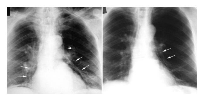
Figure-1a,b. Pneumopericardium on chest X-ray, a) First day and b) Seventh day of perforation.

Because his physical findings were minimal, the patient was discharged on the fourth day without surgical intervention.