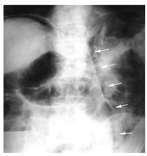
Figure-2. Pneumoretroperitoneum on abdominal X-ray, retroperitoneal free air which manifested lateral border of the psoas muscle.