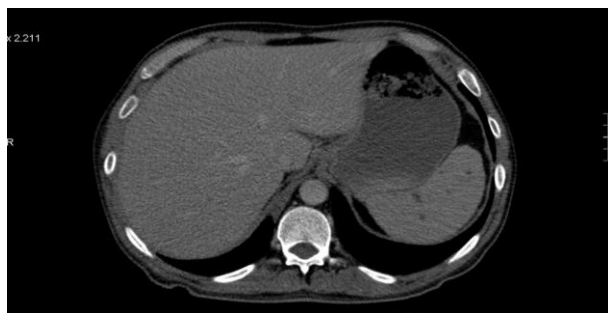
Figure-1a. Hypodense lesions in the spleen in abdominal CT.

On the 27 th day, the patient became febrile again and lip-amp-B was restarted. We suspected CDC because of abdominal pain, high ALP level and fever without any positive culture. Hypodense nodular lesions in the spleen which were compatible with CDC infection and were seen on the abdominal CT. All the antibiotics were stopped and caspofungin acetate (70 mg/day as a loading dose than 50 mg/day as maintenance) was added to the treatment of the patient.