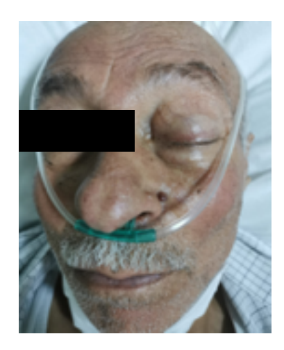
Picture 1: Note the patient's inability to open the left eyelid and limited outward gaze in the right eye.

follow-up and treatment, the patient was lost due to multiple organ failure.