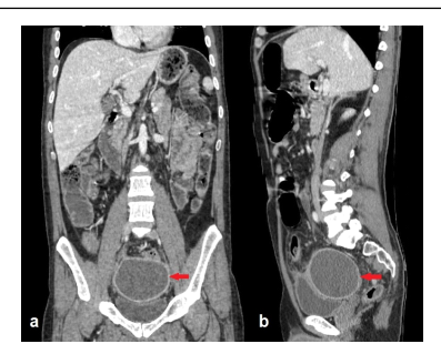
Figure 2 a,b. Coronal (a) and sagittal (b) post -contrast abdominopelvic computed tomography sections show that the hydatid cyst fills the rectovesical pouch and compresses the bladder (arrows). There is no evidence of infiltration in the adjacent stru ctures of the cyst. Note that there is no additional cystic lesion in the abdominopelvic cavity.

Contrast-enhanced CT demonstrated that the cyst was limited within the pouch without infiltrating adjacent structures. No additional cystic lesion was detected in the abdomen