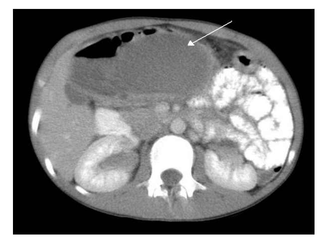
Figure-1. CT scan shows an oval, large and hypodense cystic mass (arrow) in the upper part of the cecum.