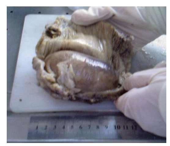
Figure-2. Macroscopic appearance of the mass.

The term of mucocele is often used as a general macroscopic descriptive term for dilatation of the appendiceal lumen by mucinous secretions (2-6). MCA is the most common form, accounting for 63% to 84% of mucocele cases (2,4,7). Mucinous cystadenoma is a tumor of the appendix associated with cystic dilatation (3,4). The incidence of this entity changes between 0.2 and 0.95% (5). It has been reported that MCA is seen more frequently in women and those over 50 years (1, 4, 6). On the contrary, MCA in children is rarely seen and frequently of ovarian origin (3).