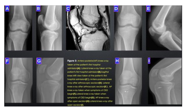
Figure-3. Antero-posterior (AP) knee X-ray taken at the patients first hospital admission (A). Lateral knee X-ray taken at the patients first hospital admission (B). Sagittal knee MRI section taken at the patients first hospital admission (C). Antero-posterior (AP) knee X-ray after arthroscopic excision (D). Lateral knee X-ray after arthroscopic excision (E). AP knee X-ray taken when symptoms of OSD begin (F). Lateral knee X-ray taken when symptoms of OSD begin (G). AP knee X-ray after open excision(H). Lateral knee X-ray after open excision (I).