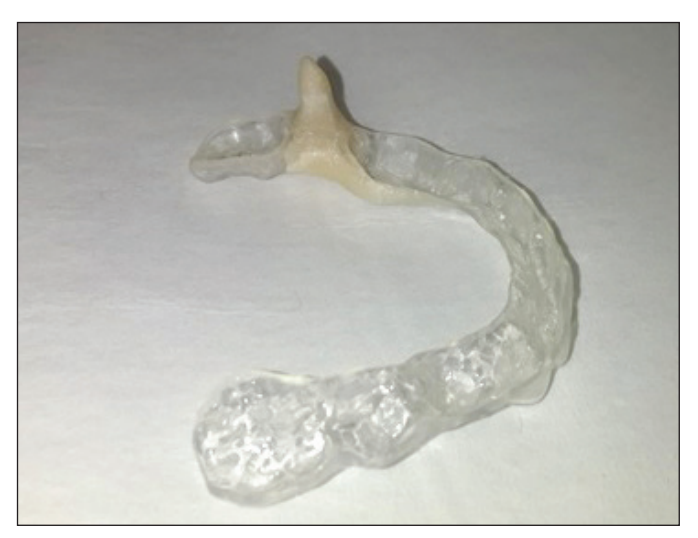
Figure 1: An obturator is prepared for marsupialization.

When the localization of the cysts was analyzed, mandible was found to be the most affected jaw (63.4%).