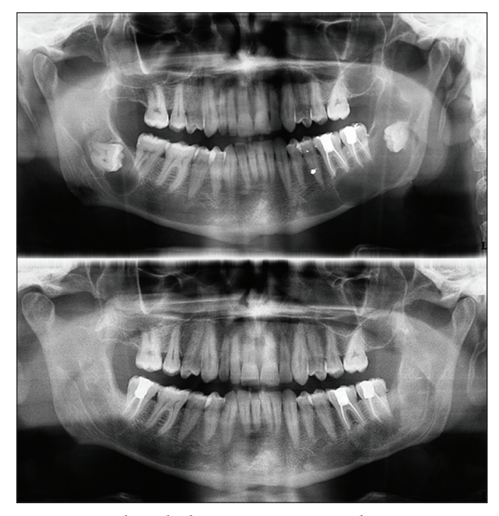
Figure 2: Bilateral dentigerous cysts and post-operative panaromic image after 18 months.

The regions where the cysts were most prevalent were listed as mandibula posterior (36.6%), maxilla anterior (36.6%) and mandible ramus (27.8%). The cysts were seen as unilateral in 10 patients and as bilateral in 1 patient (Figure 2).